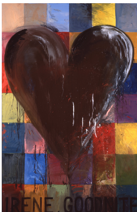
↑ Jim Dine, Irène... , 1993. Oil and enamel on canvas, 213.4 × 137.2 cm.

PRESS PRIVATE VIEW: THURSDAY, FEBRUARY 14, 2020 FROM 9:30 AM TO 1:00 PM