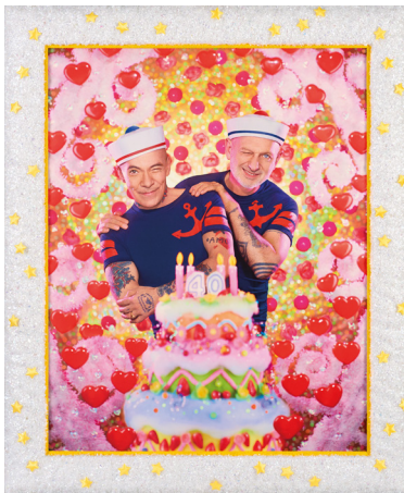
↑ Pierre and Gilles, 40 years – Self-portrait , 2016. Photograph printed by inkjet on canvas and painted, 123.5 x 102 cm. One-of-a-kind print. Photo: Pierre & Gilles. Courtesy Templon, Paris - Brussels