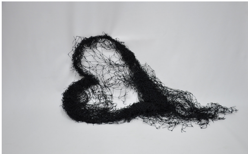
↑ Annette Messenger, Resting Heart , 2009, wire, black netting, 43 x 100 x 17 cm, Antoine de Galbert Collection, Paris

Musée de la Vie romantique Catherine SOREL presse.museevieromantique@paris.fr +33 (0)1 71 19 24 06